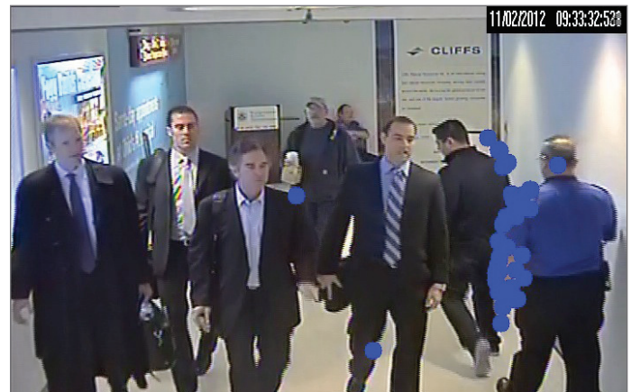
Demonstration of the VAST in-the-exit solution: The blue dots in the image above indicate individuals moving in the counter-flow direction.

The VAST effort is addressing the needs of the Transportation Security Agency (TSA) to monitor and intercept threats by individuals to airport security. ALERT, the TSA Ohio Senior Federal Security Director, and the Commissioner of Cleveland Hopkins International Airport collaborated with ALERT researchers, Siemens Corporate Research and TSA practitioners in 2011 to develop and deploy “in-the-exit” and “tag-and-track” solutions at Cleveland Hopkins International Airport.